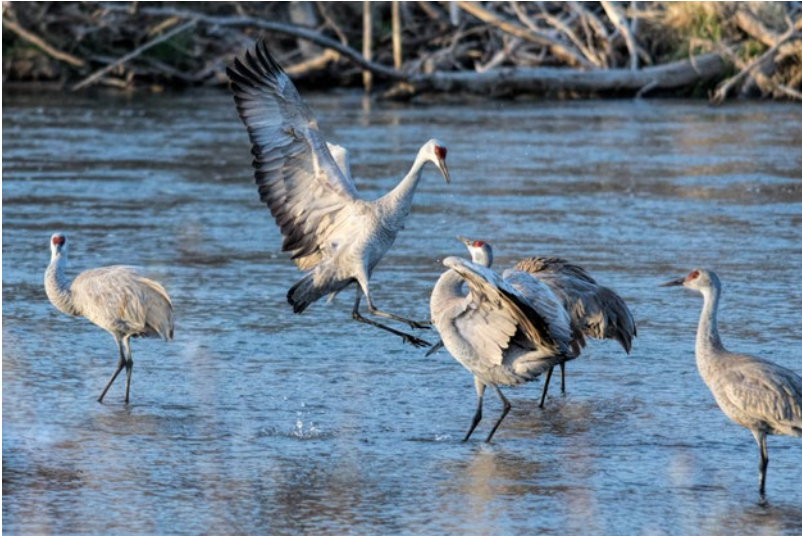
Sandhill Cranes Dancing, Lincoln County Nebraska

and it is enough. Chicks come, and we hear her whistles and notes.